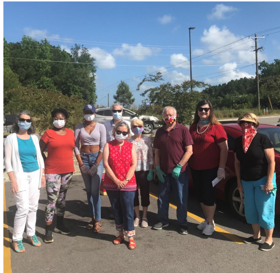
Both WIP and PEARLS Advisory Board Members were on hand to help out.

The pictures below are from May 16. WIP advisory board members, as well as Community Foundation staff, traveled to Hampton County to drop-off the goods. Here are some pictures from that wonderful event.